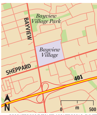
JONATHAN RIVAIT / NATIONAL POST